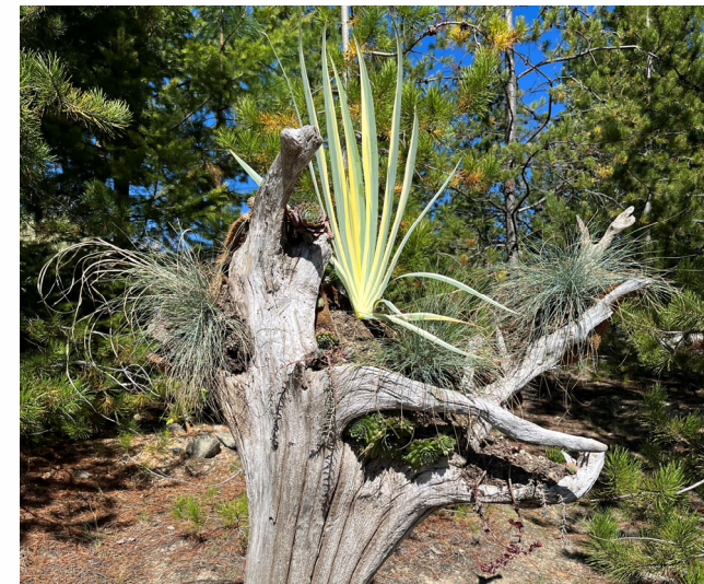
Your water conservation efforts, such as xeriscaping, help prevent water shortages!