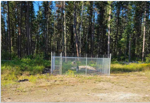
Well site fencing installed in 2023