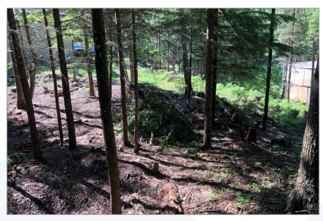
Fire mitigation project in Riondel, 2022