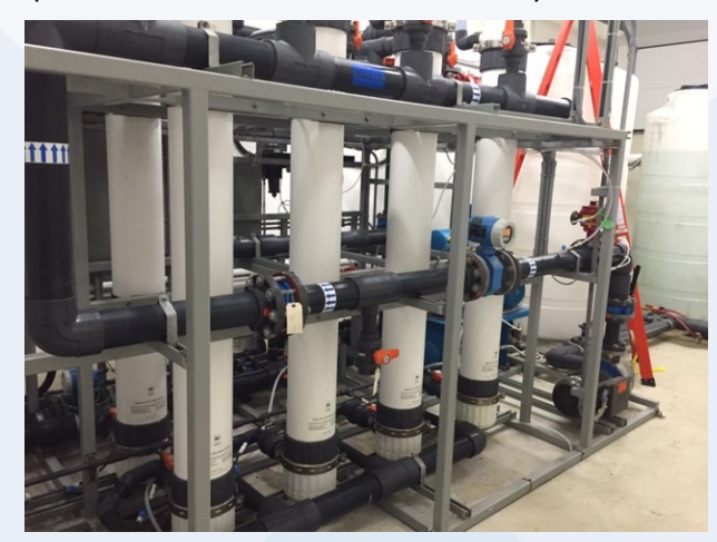
Riondel Water System treatment facility

Treated water is stored in a 100K gallon reservoir prior to release into the distribution system.