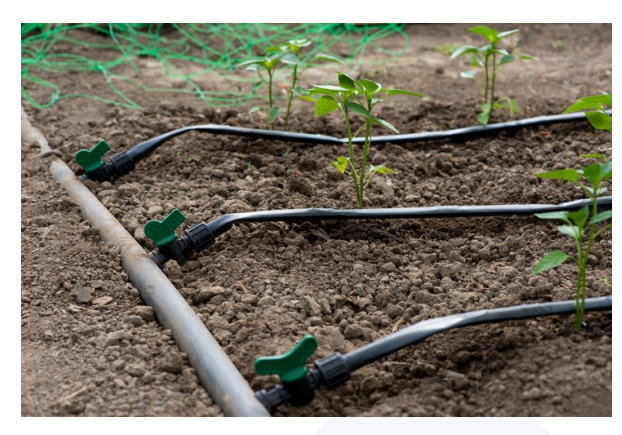
Your water conservation efforts help prevent water Shortages! Watering using drip irrigation, a watering can or hand held hose eliminates overspray.