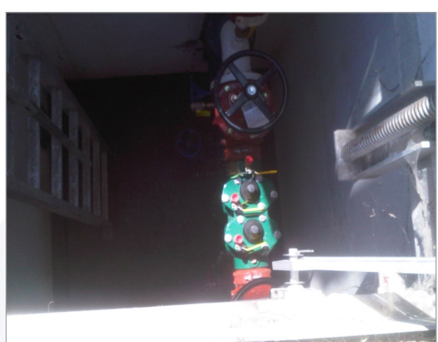
Vault from City of Castlegar supply housing meter and backflow assembly