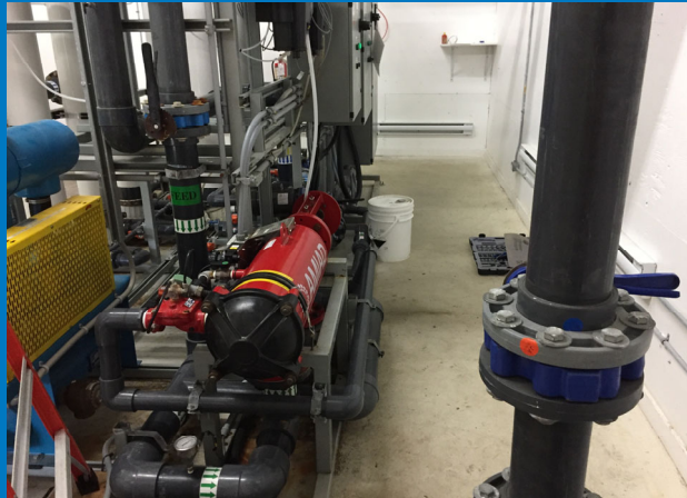
Riondel Water Treatment Plant

Incorporated in 1965, the Regional District of Central Kootenay (RDCK) is a local government that serves 60,000 residents in 11 electoral areas and nine member municipalities. The RDCK provides more than 160 services, including community facilities, fire protection and emergency services, grants, planning and land use, regional parks, resource recovery and handling, transit, and much more. For more information about the RDCK, visit www.rdck.ca .