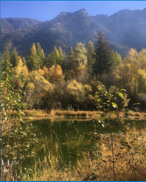
Wetlands at former Lister Water System source.