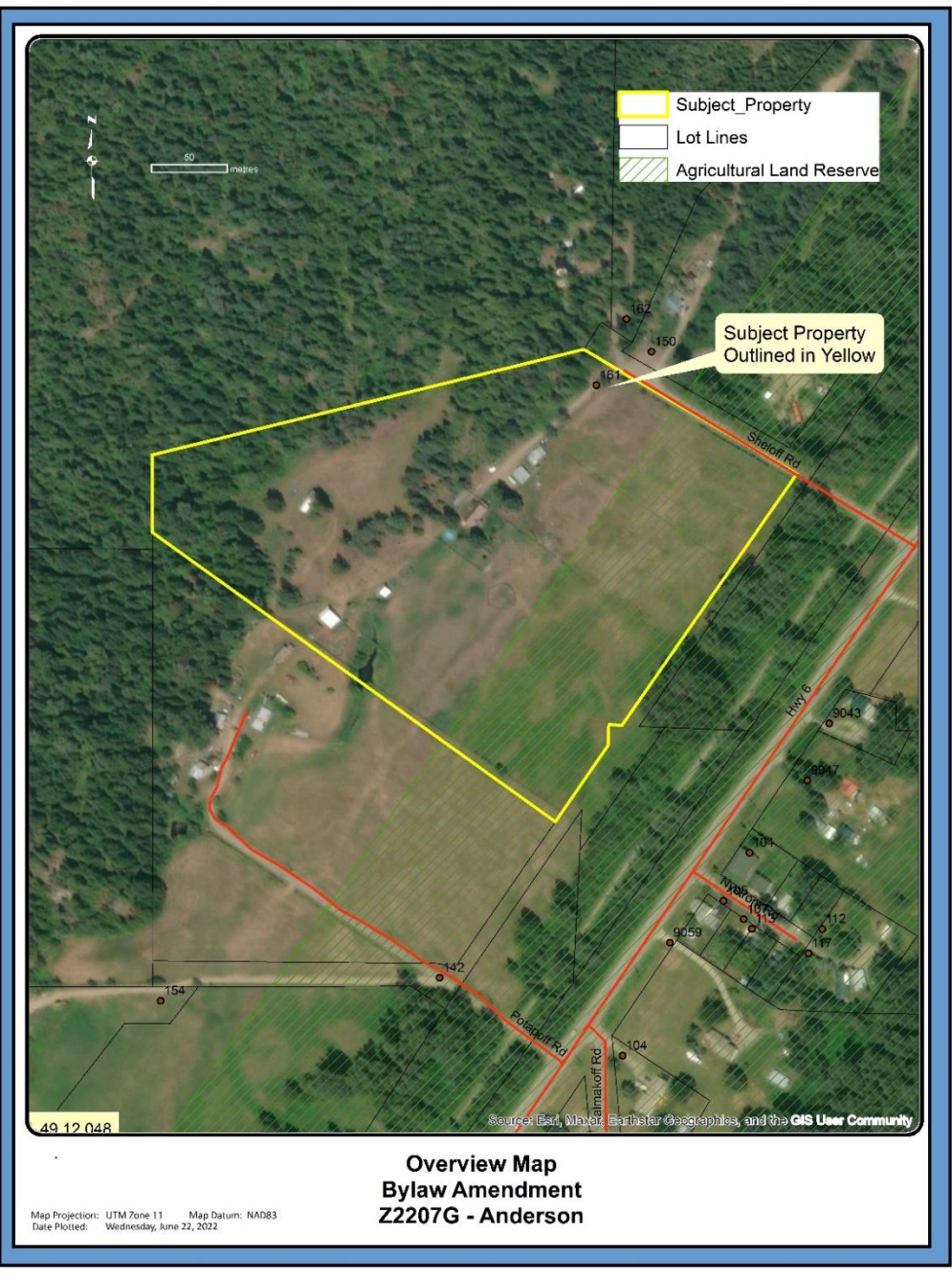
Figure 1: Overview Map

The subject property is located just north of the Village of Salmo. It is approximately 6.6 hectares in size. It is partially located in the Agricultural Land Reserve. Much of the southeastern portion of the property is flat farmland, but there is a break in the topography on the west side where there is a short, steep rise to a flat bench. The applicants seek to subdivide that portion of the property and create one additional 2.4 ha lot, leaving the 4.2 ha remainder. This proposed remainder is the most farmable portion of the property. There is a large, level building site on the upper bench.