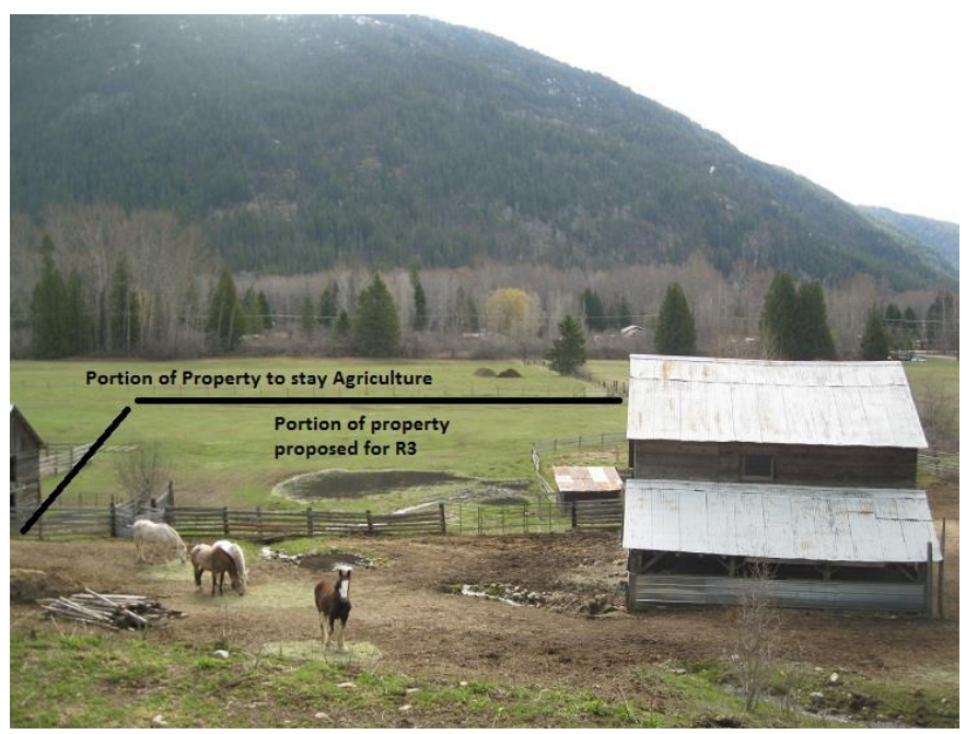
Figure 4: Proposed line of subdivision