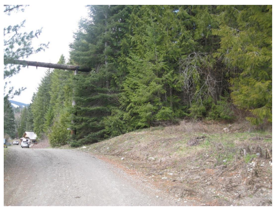
Figure 5: Driveway Access, short steep rise on right side of image