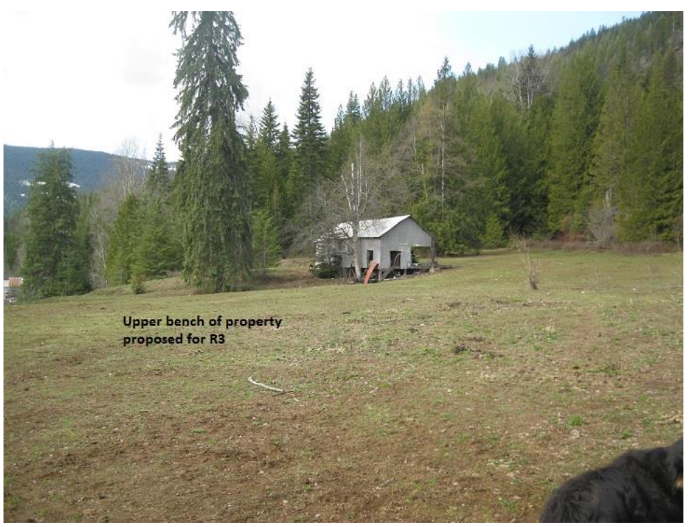
Figure 6: Proposed new lot and building site