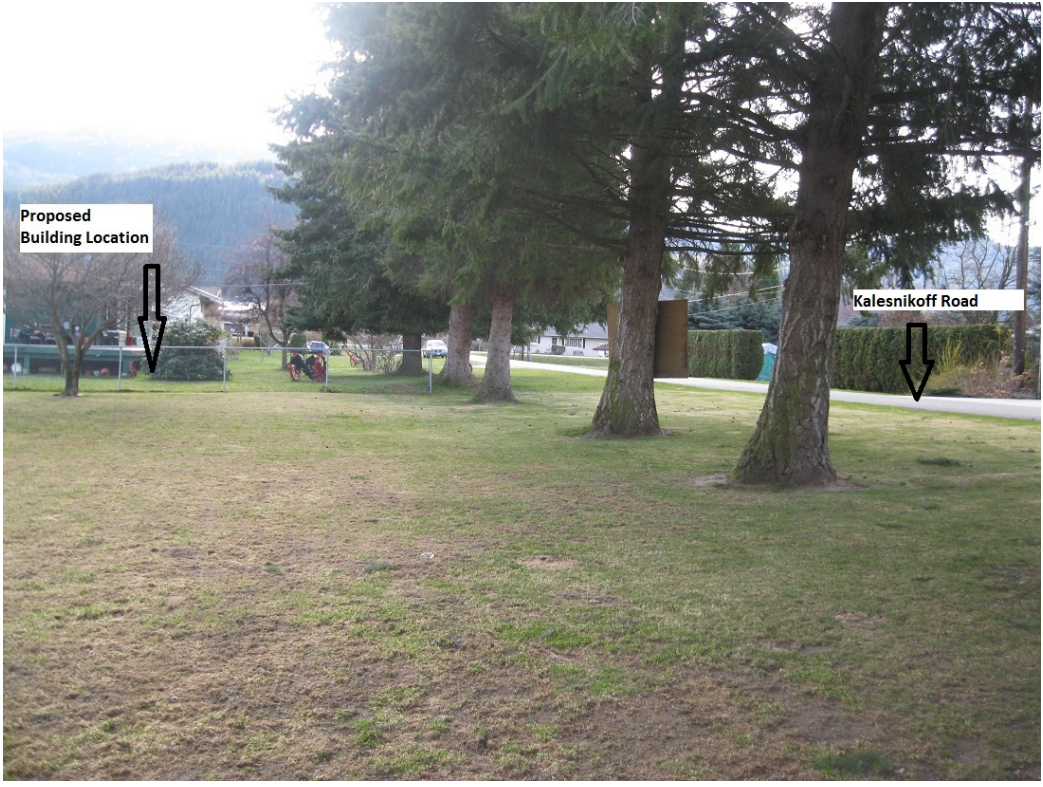
Figure 5: Proposed accessory building location relative to Kalesnikoff Road