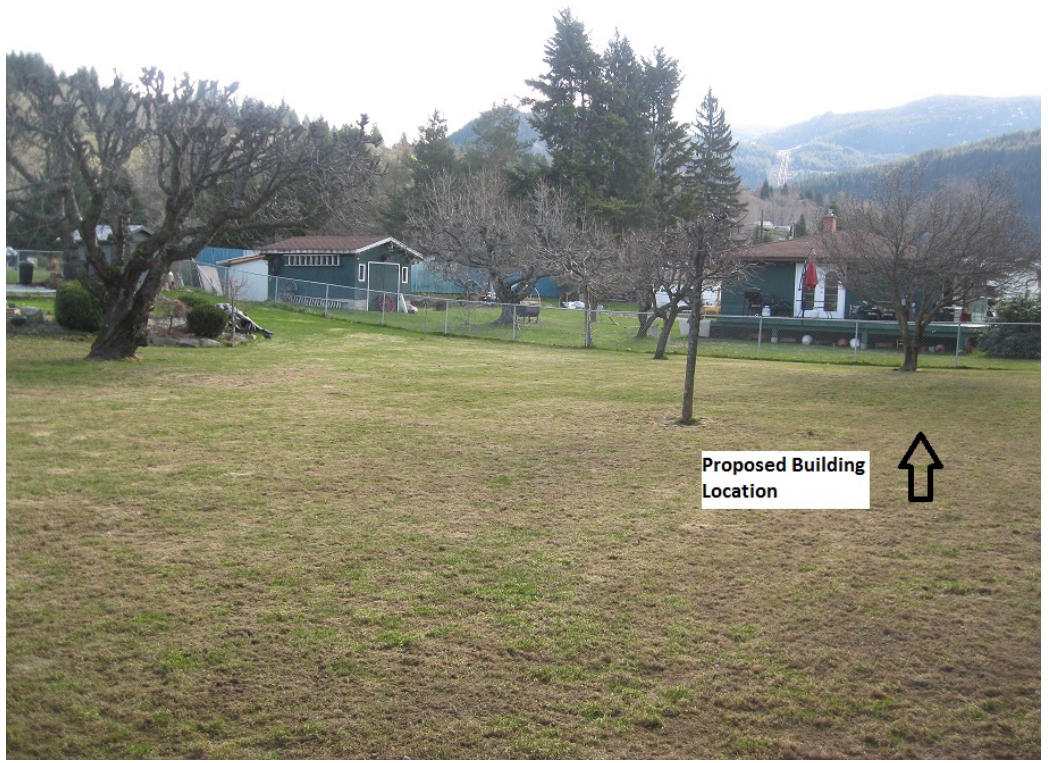
Figure 4: Proposed location of accessory building, facing neighbor to the east