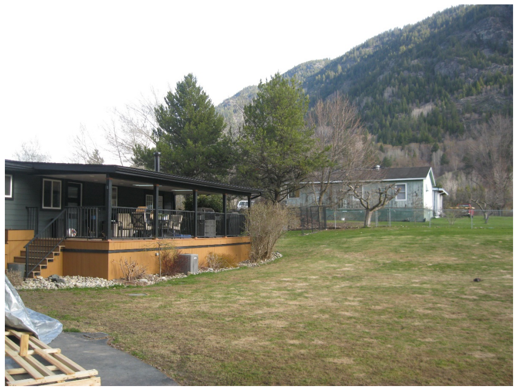
Figure 6: Existing house on subject property - facing north