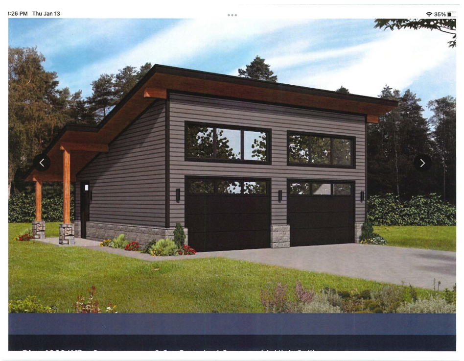
Figure 3: Artistic rendering of proposed accessory building