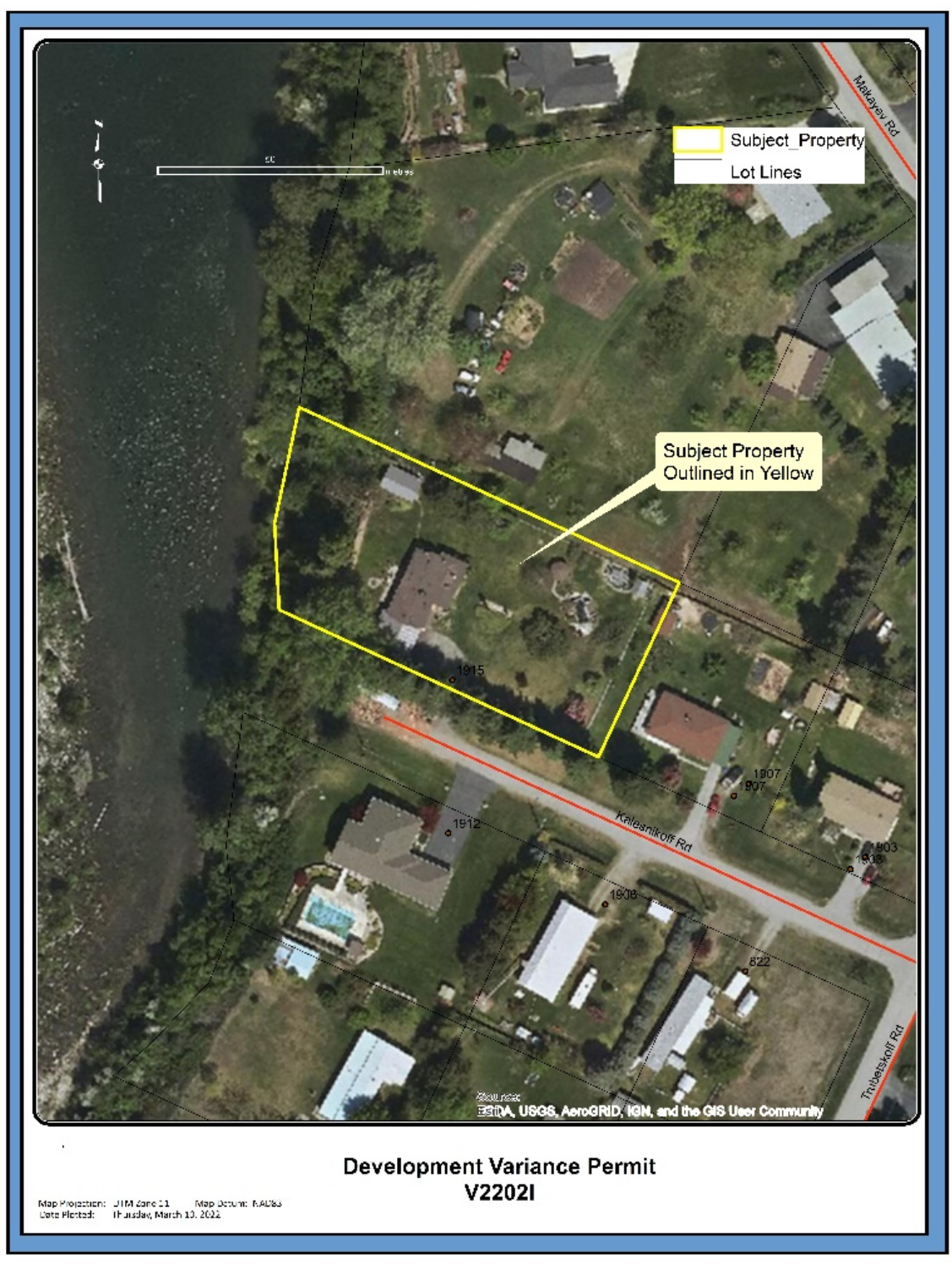
Figure 1: Overview Map