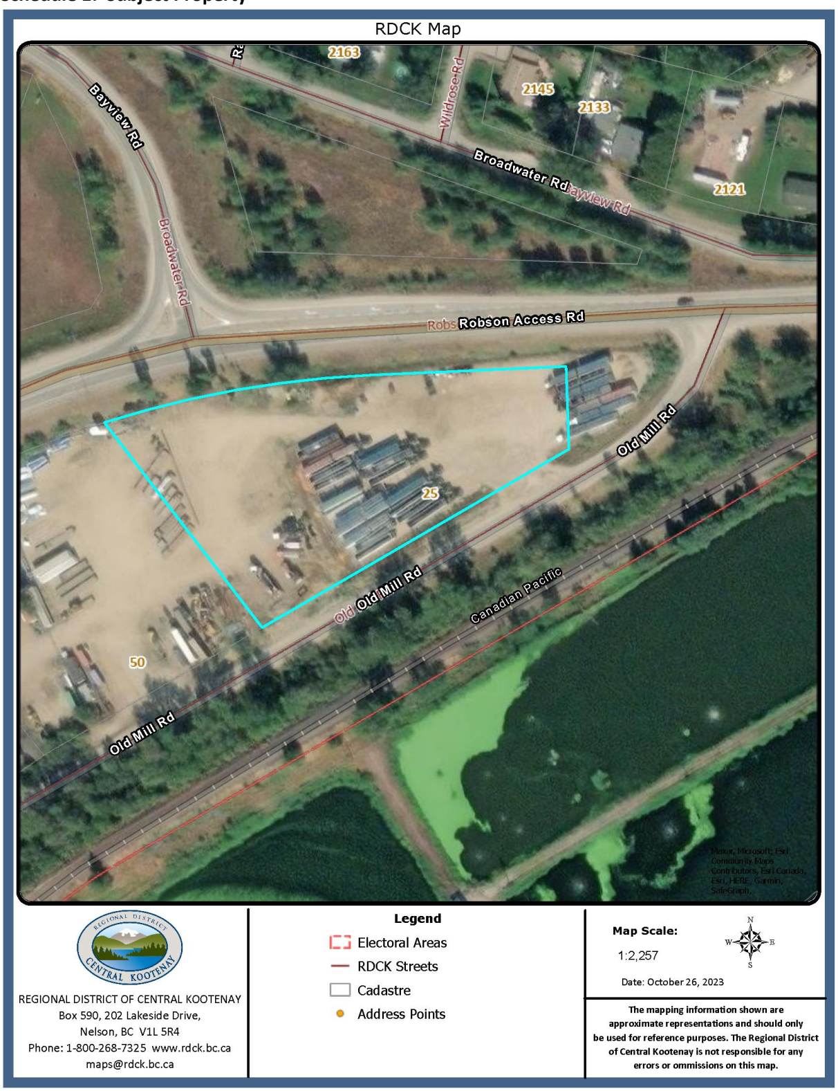
Schedule 1: Subject Property