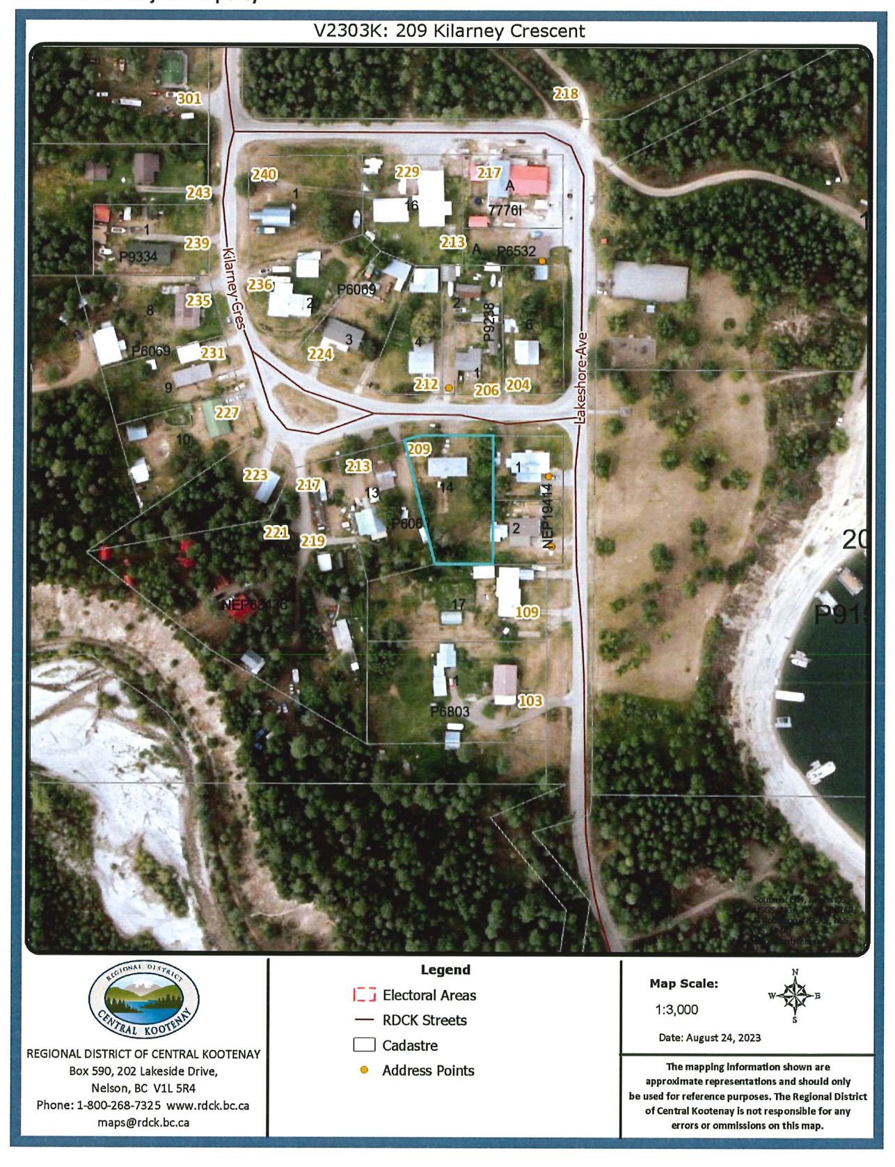
Schedule 1: Subject Property