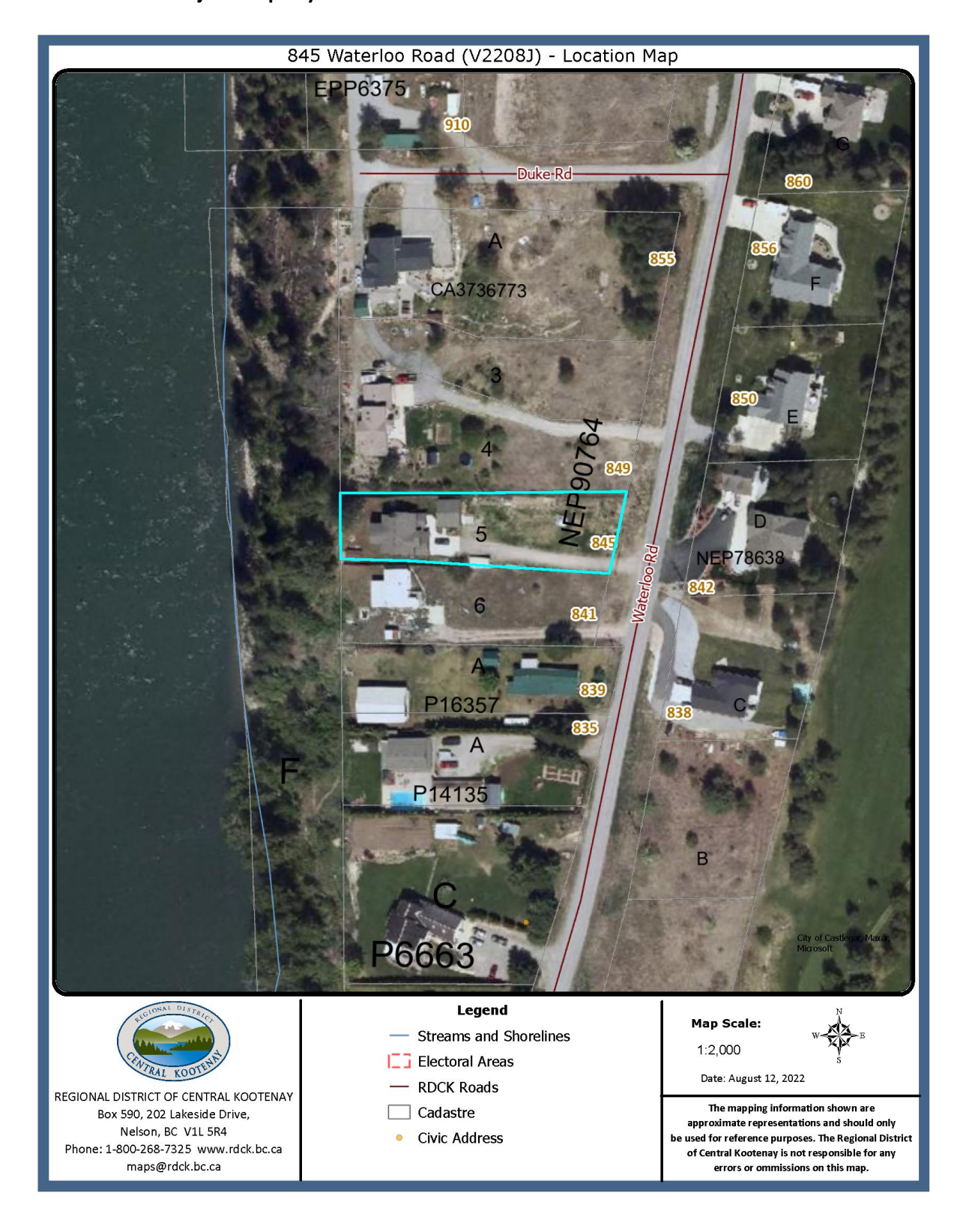
Schedule 1: Subject Property