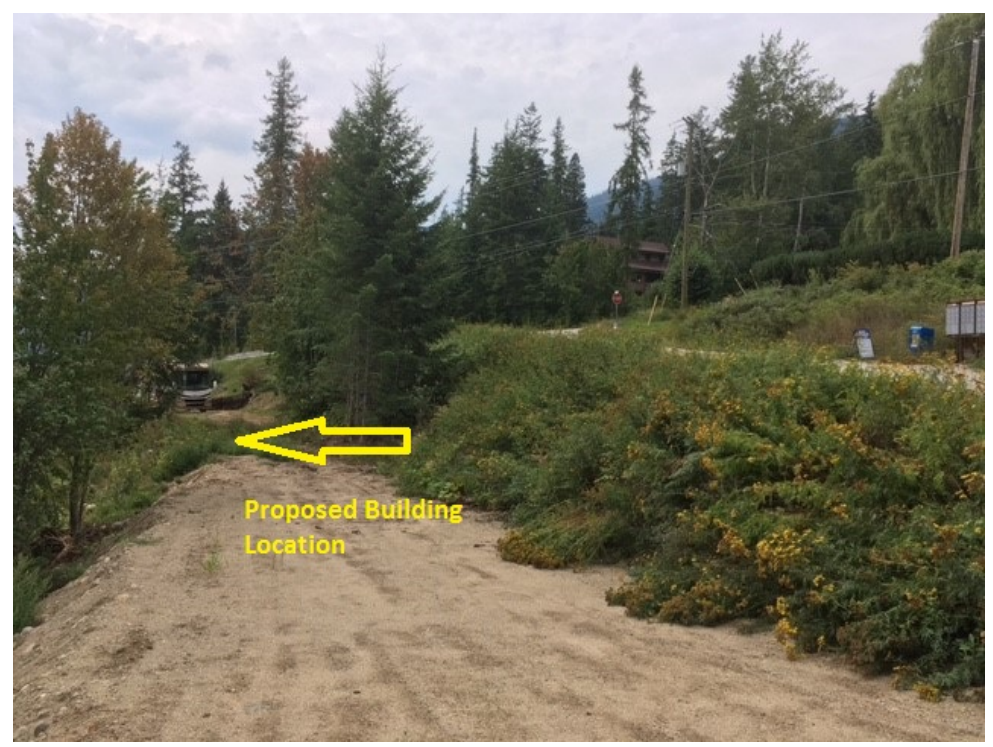
Figure 5: Proposed Building Site Facing SW