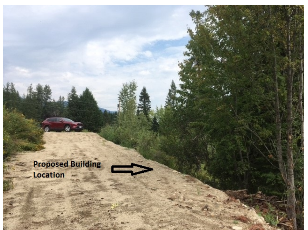
Figure 3: Proposed Building Location Facing N/E