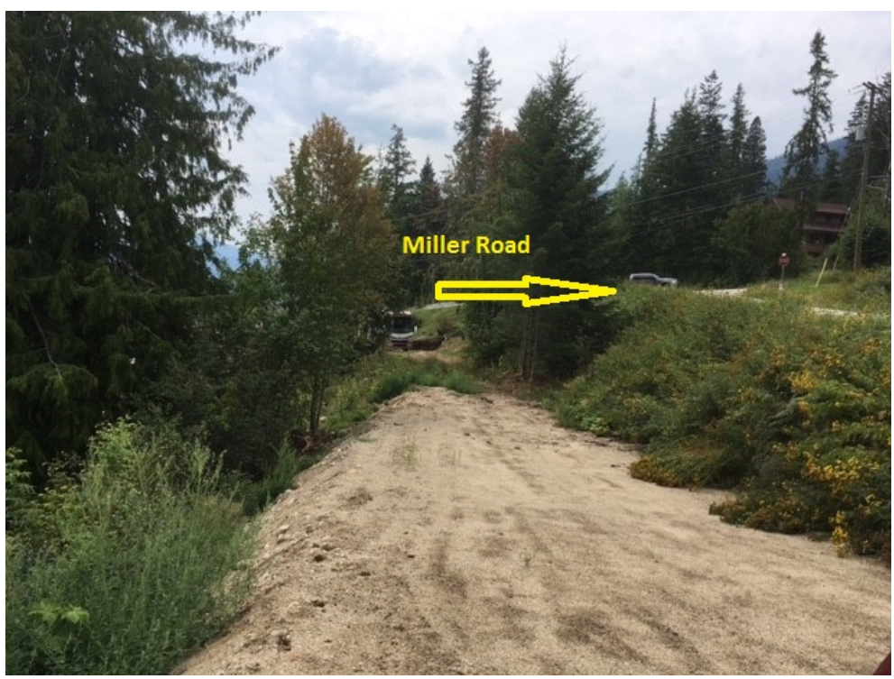
Figure 4: Driveway relative to the location of Miller Road