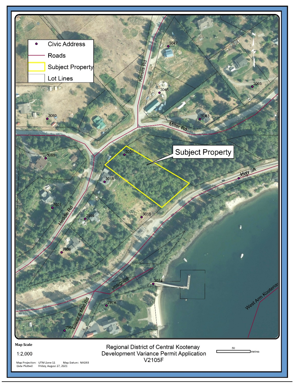
Figure 1: Overview Map