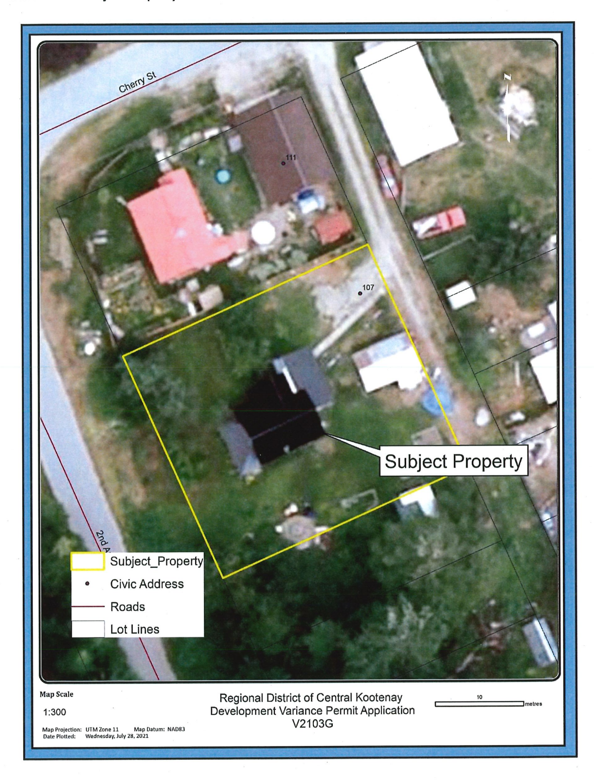
Schedule 1: Subject Property