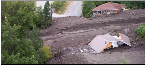
Figure 1. Debris flow material that was deposited on the Kuskanook Creek fan after a rainfall event in August 2004.

This document is intended to help you understand this hazard in the Kootenay Region, identify some indicators that could be cause for concern and learn how to report a potential emergency.