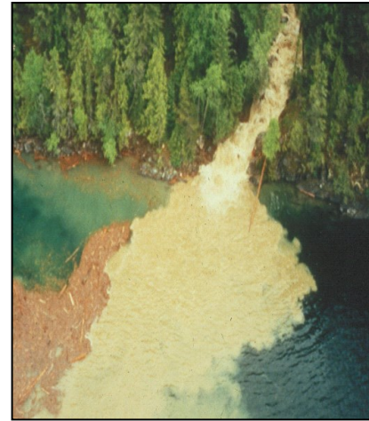
Figure 2. Debris flood on Memphis Creek. Note the large volume of floating debris in the lake and the uncharacteristically turbid water.