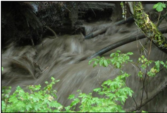
Figure 4. Turbid water in Gar Creek the day before the Johnson's Landing landslide on July 12, 2012.

If you observe an unusually large and recent change in the accumulation of debris in a creek channel, call the provincial emergency number at 1 800 663-3456 to report your observations.