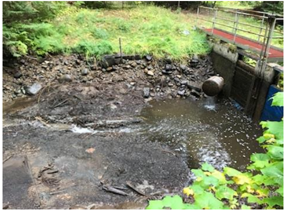
Ymir Water Intake

Decreased water demands should extend service life, resulting in lower costs. This is particularly beneficial when it comes to water filters. The Regional District has four water treatment plants that use disposable cartridge filtration: Balfour, Grandview, Ymir and South Slocan. Balfour and Grandview plants have proven not economically feasible to operate and our Regulator, Interior Health has agreed to a filtration deferral program where the one micron absolute filters have been decommissioned. One other water system is currently facing unsustainable cartridge filter consumption but Interior Health has not yet