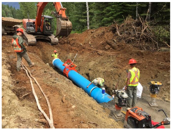
Arrow Main Line Replacement

The Water Bylaw identifies the requirement for metering by the owner for all existing Multiple Dwelling Properties, Commercial properties, Industrial properties, Institutional properties, golf courses, Agricultural Land, and recreation facilities by December 31, 2019, and all Single Family Dwelling Properties are to be metered by December 31, 2024. It is anticipated that these requirements will be repealed and replaced with implementation of this