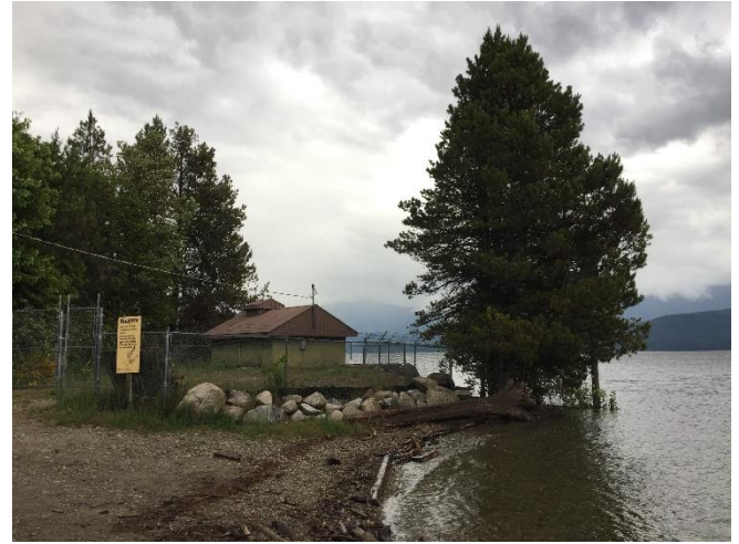
Balfour Water, Kootenay Lake Pump Station

Managing water demand is often cheaper and more beneficial than capacity upgrades. Water shortages due to high demands also result in increased costs due to staff response