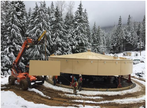
New Ymir Reservoir