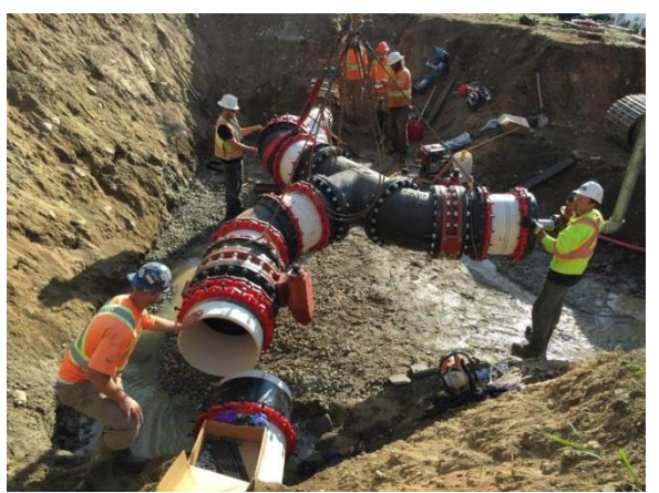
Arrow Mainline Replacement

A formal Water Loss Control & Leak Reduction Program will be established. Water loss and control programs consist of three steps: Water Audit, Intervention and Evaluation.