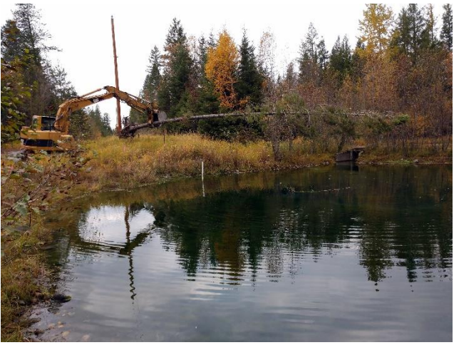
Wetland Construction at Old Lister Intake

Stage 3 Water Conservation Measures prohibits watering of all lawns. Due to business concerns raised by one golf course, Staff has been reluctant to enforce Stage 3 Water Conservation measure to golf courses in the past while Stage 3 was enforced for all other users within a community. There has been recent community support to apply the same water conservation measure to all