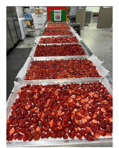
Strawberries for freeze drying