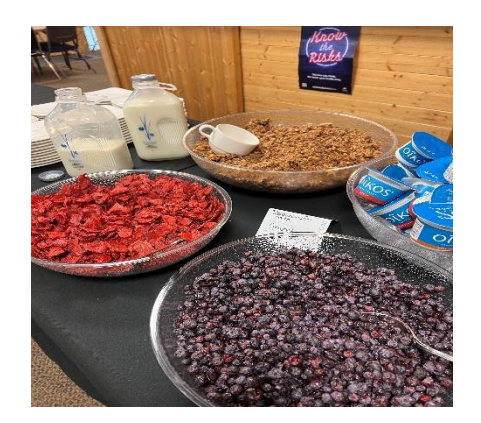
Our local 90% LOCAL Breakfast at FABX