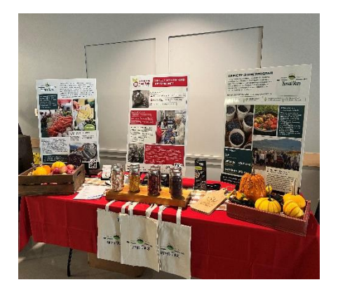
Our display at the FABX

In closing, we greatly appreciate your support towards the current programs that are working for our local producers and the residents of the Creston Valley. Together we can continue to drive change and ensure that we have a vibrant agriculture culture in the Creston Valley