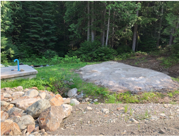
Old reservoir lines were decommissioned and the site was remediated.