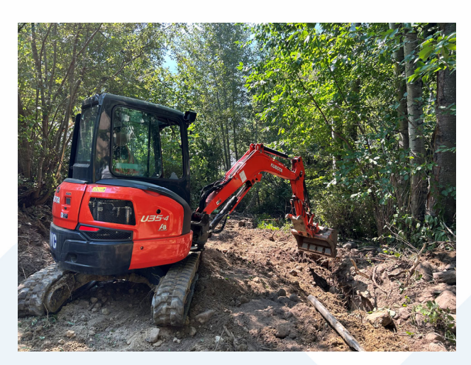
Reservoir maintenance in 2023