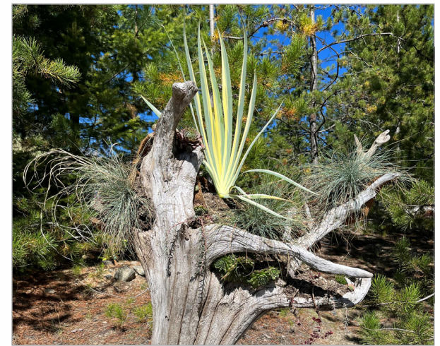
Your water conservation efforts, such as xeriscaping, help prevent water shortages!