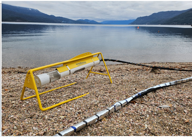
New lake pump, 2023