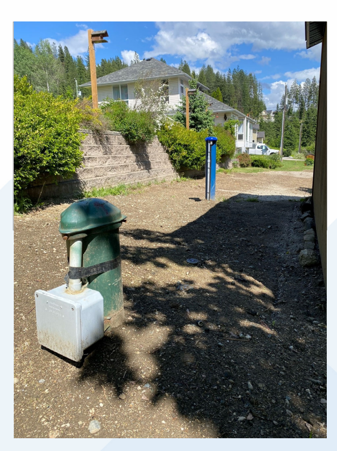
New well site remediation