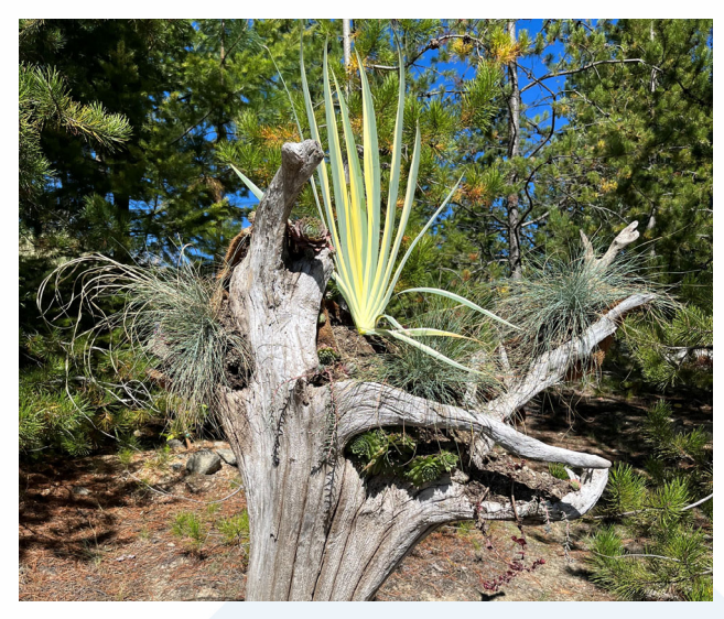
Your water conservation efforts, such as xeriscaping, help prevent water shortages!