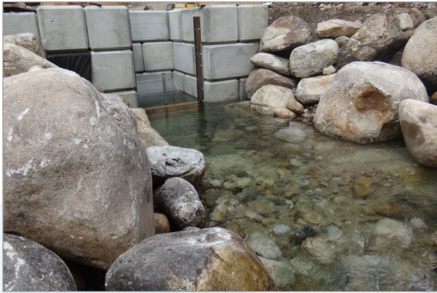
Sanca Creek intake