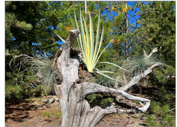
Your water conservation efforts, such as xeriscaping, help prevent water shortages!