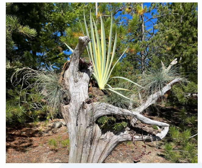
Your water conservation efforts, such as xeriscaping, help prevent water shortages!