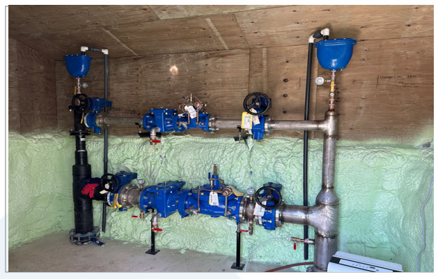
New Pressure Reducing Valve Station