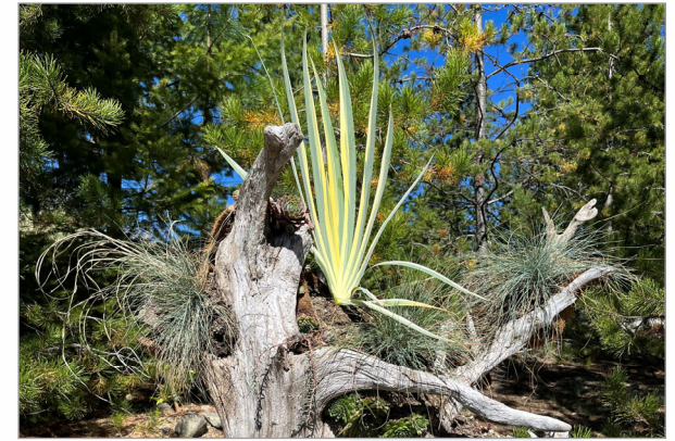
Your water conservation efforts, such as xeriscaping, help prevent water shortages!