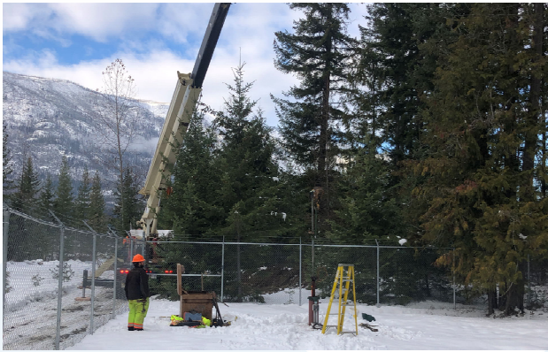
Well pump rehabilitation