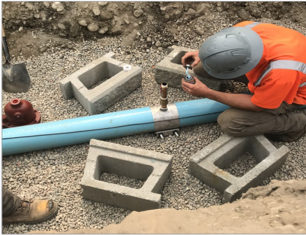
Balfour Wharf Road water main replacement