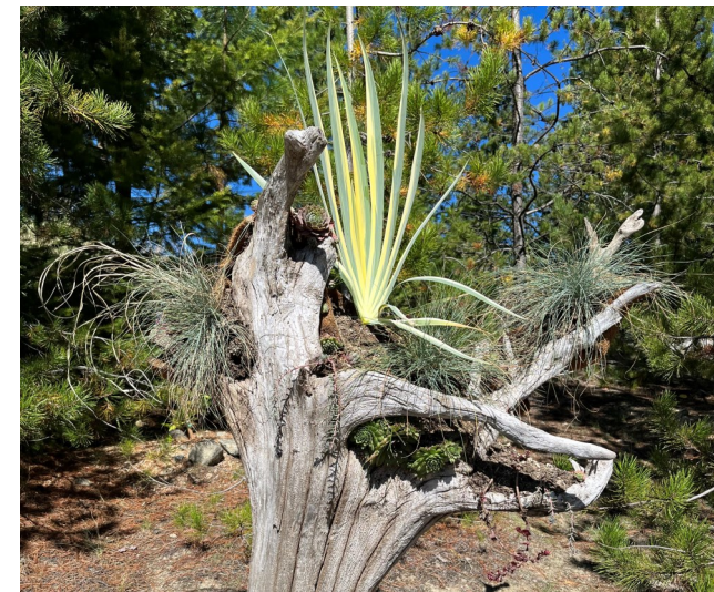
Your water conservation efforts, such as xeriscaping, help prevent water shortages!