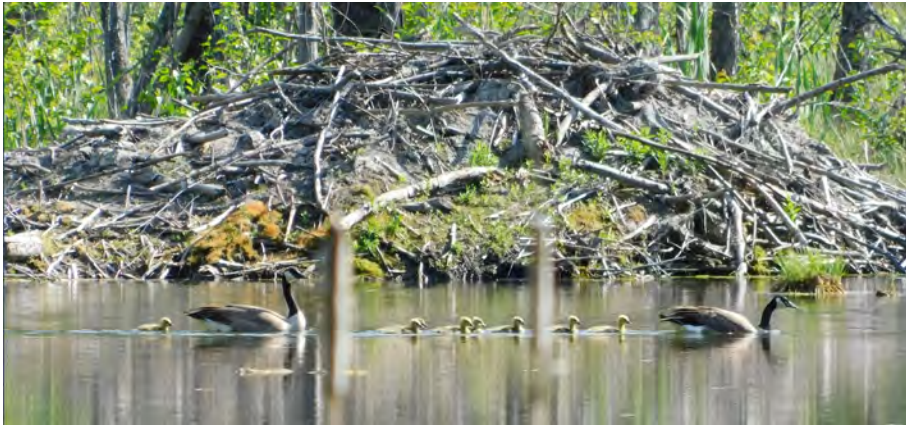
Geese & beaver dam Photo taken at Snk'mip Marsh Sanctuary by Moe Lyons.