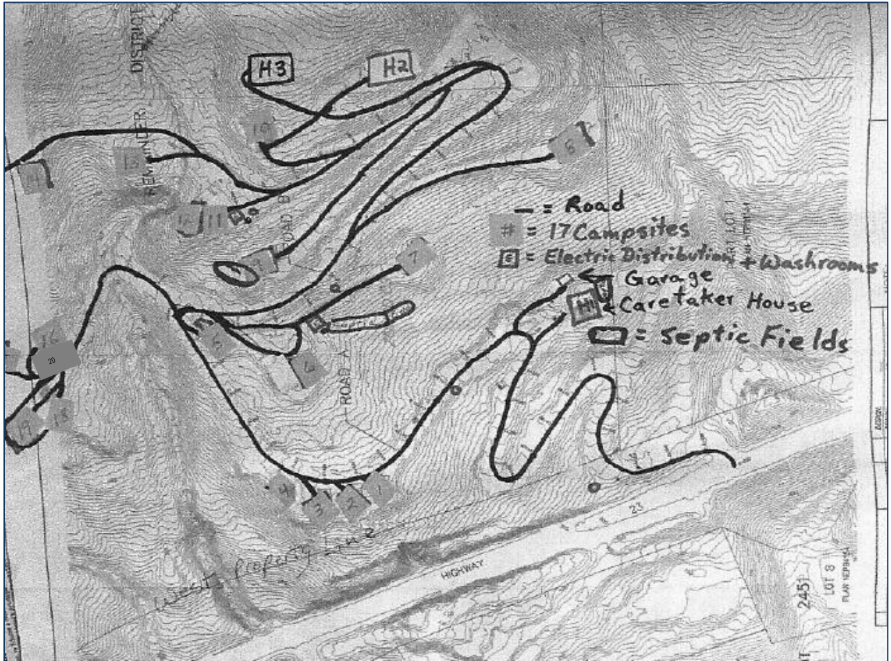
Campsite Site Plan