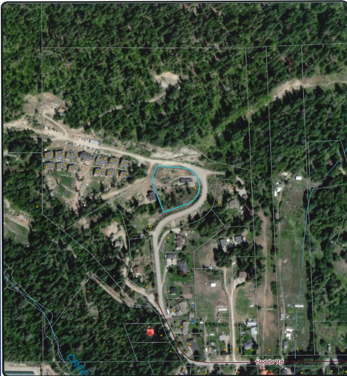
3239 Heddle Road (V2211F) - Location Map