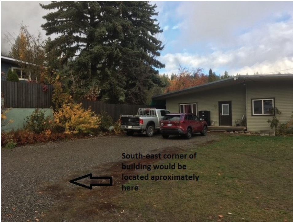
Figure 6: House on subject property