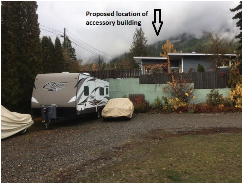
Figure 4: View from end of driveway

Proposed location of accessory building relative to 26th Ave North