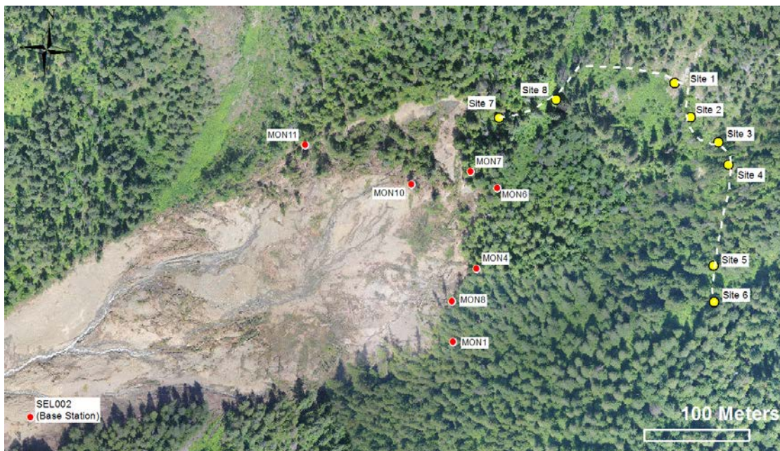
Figure 1. Measurement locations that are measured by hand are identified in yellow, and measurement sites surveyed by SEL from a base station are shown in red. The dashed line shows the approximate location of the upper crack that bounds the top edge of the potentially unstable area.

The measurement of the displacement of the upper crack over the past five years shows systematic, progressive movement at the apex of the tension crack (e.g. Figure 2), but limited or no movement towards the outer edges. Table 1 summarizes the measurement data.