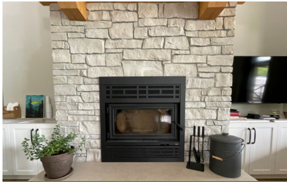
Efficient wood fireplace to minimize air leakage

"Talk to others and gain real world knowledge about unfamiliar systems—for example, placing a heat pump outdoor condenser unit on a small outdoor deck will have a drastic impact on the ambient noise level. Its best located well out of the way."