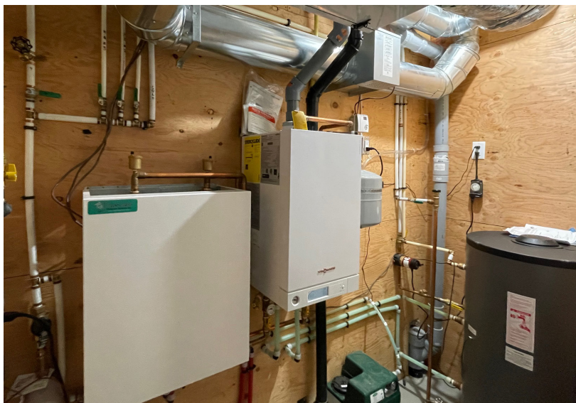
Mechanical room and high efficiency natural gas boiler for backup space heating and domestic hot water