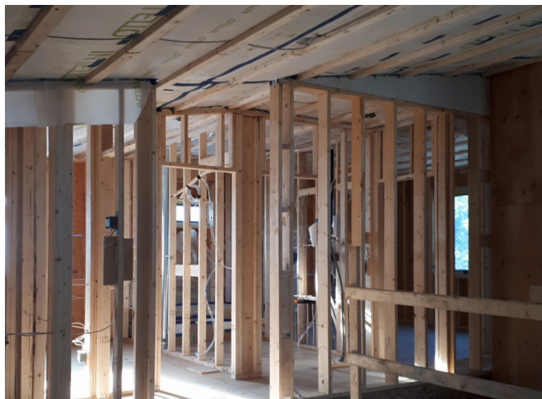
Interior framing and ceiling with smart barrier