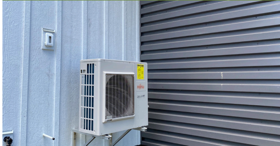
Air-Source heat pump for central heating and cooling